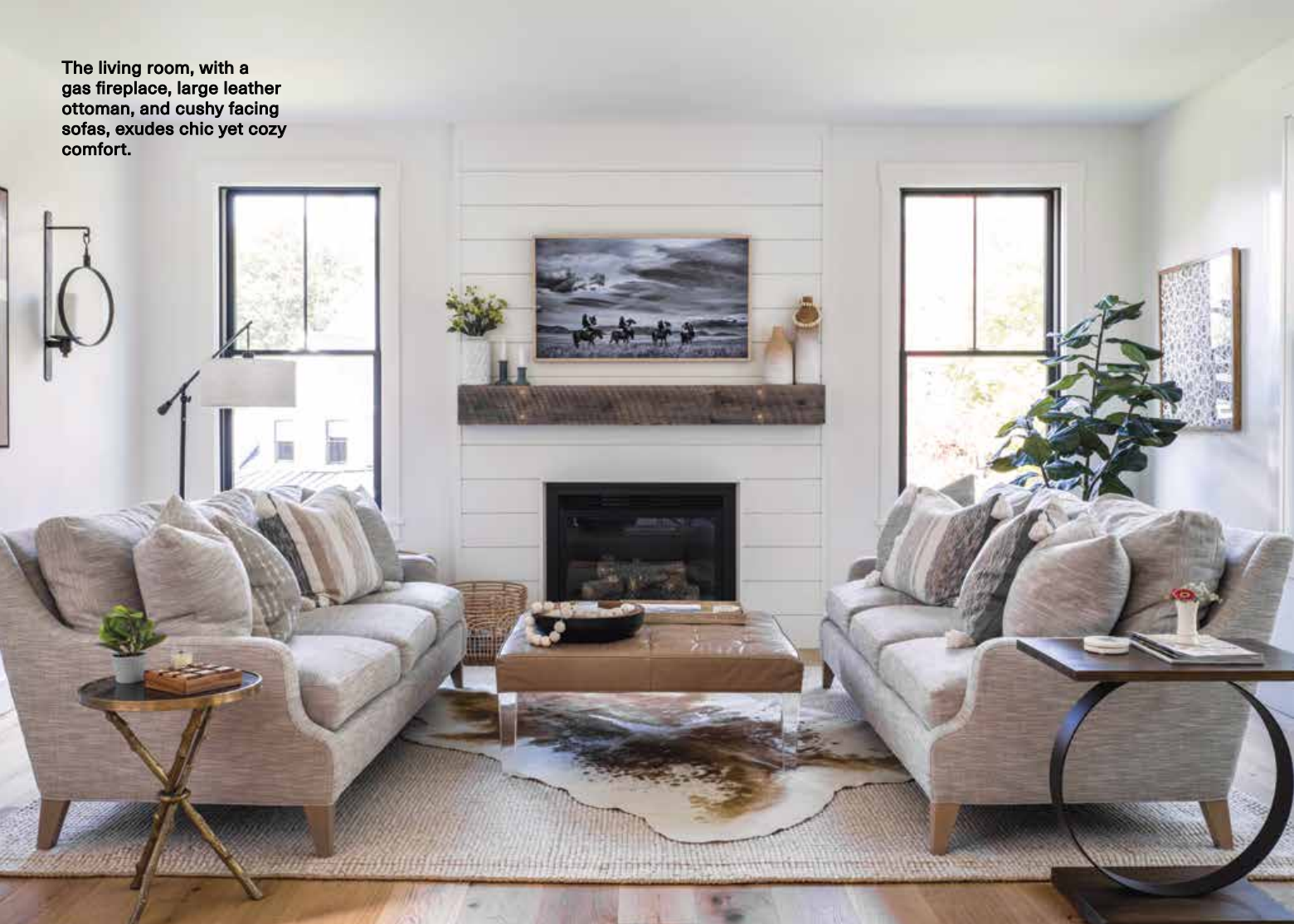
The living room, with a gas fireplace, large leather ottoman, and cushy facing sofas, exudes chic yet cozy comfort.

“I like a timeless, minimalist look with clean, simple lines, neutral colors, and carefully curated pops of color.”