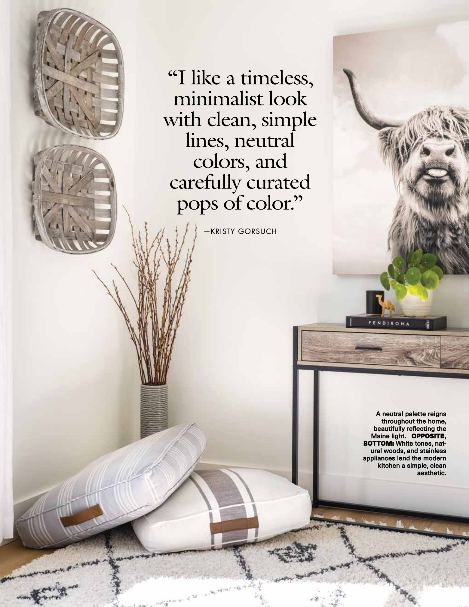
A neutral palette reigns throughout the home, beautifully reflecting the Maine light. OPPOSITE, BOTTOM: White tones, natural woods, and stainless appliances lend the modern kitchen a simple, clean aesthetic.