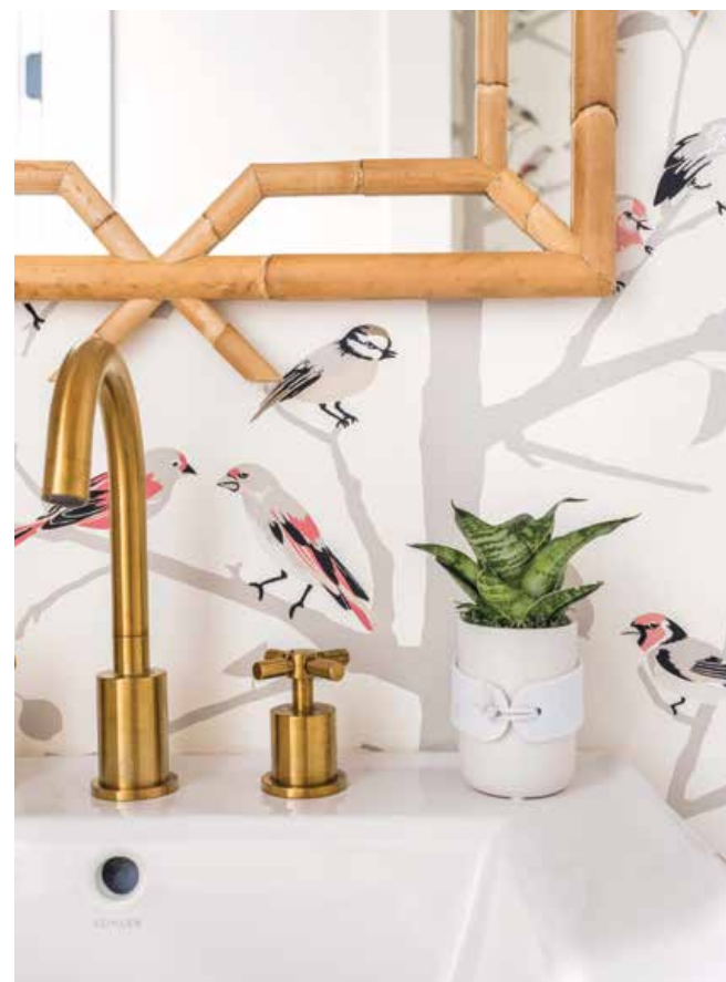
TOP, RIGHT: On chilly Maine days, the soaking tub provides more than just a handsome focal point. ABOVE: Wallpaper in the powder room is indicative of a playful tone displayed throughout the home.